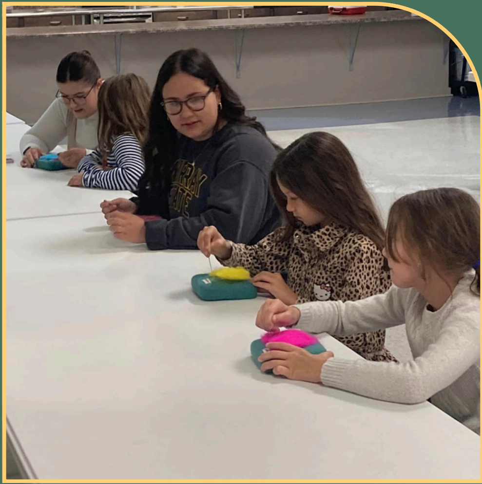
MSU Family & Consumer Science students teach Calloway 4-H'ers how to Needle Felt Wool